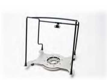
Figure 1 : Support mount – Device section