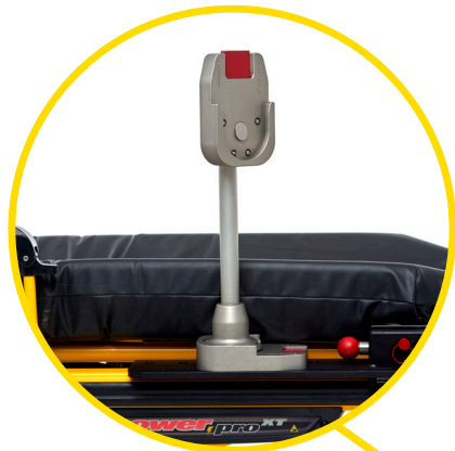
Safety MD Transporter