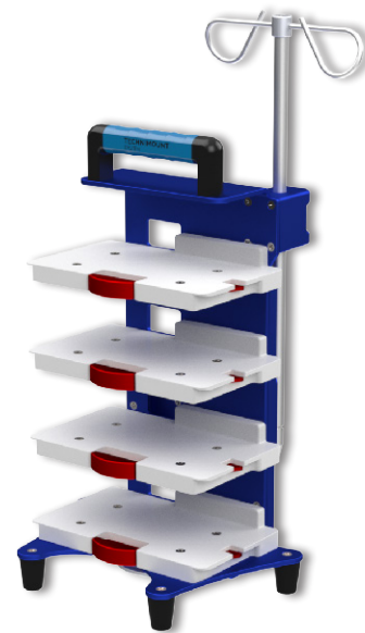
Bracket Pro Serie 80-FL4 for Stacks of 4 B-Braun Pumps