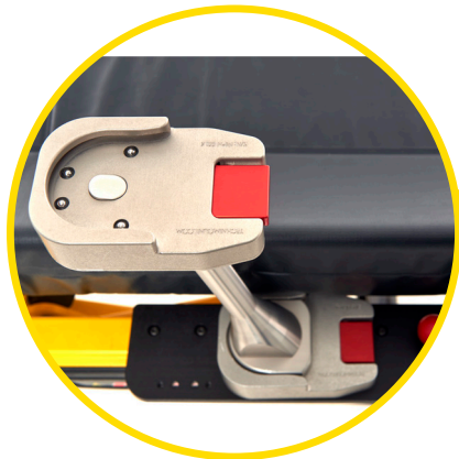
Safety MD Transporter (Horizontal)