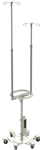
IV Stand -120