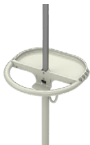
Integrated Tray Handle