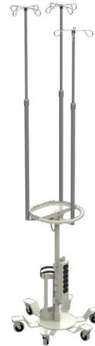
IV Stand -130