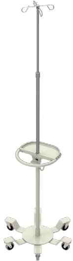
IV Stand -115