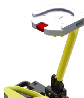
Safety Arm System