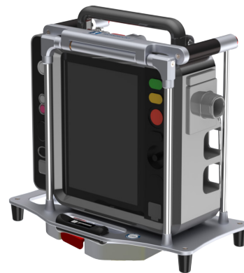
Standard Surface Base